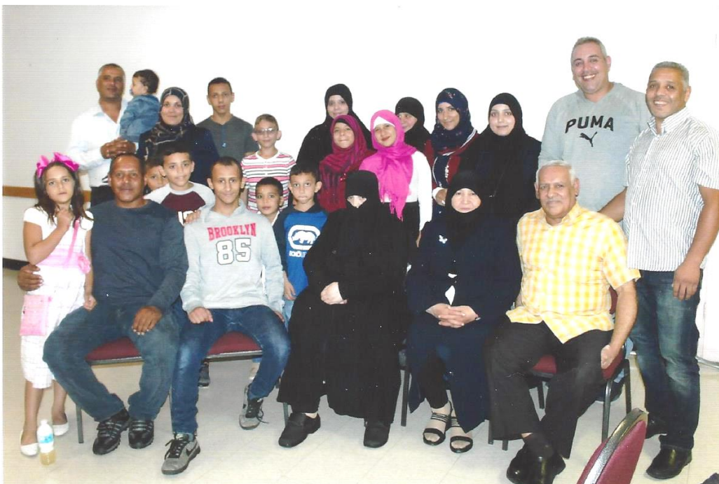
Figure 1. The Al Mansour/Mansour/Hamada Syrian Immigrant Families in Belleville, 23 September 2018