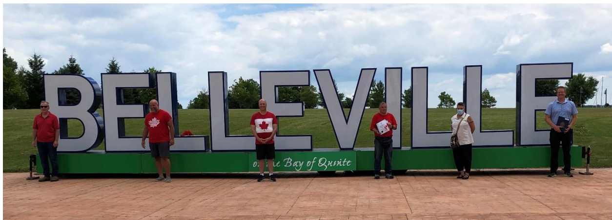
Life at Bridge Street United Church (Belleville, ON) during COVID-19 3 July 2020

Also shown (from the left)... Neil Ellis, Member of Parliament; Todd Smith, Member of Provincial Parliament; and, Mitch Panciuk, Mayor of Belleville.