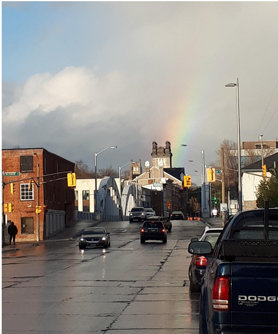
Life at Bridge Street United Church (Belleville, ON) during COVID-19 3 July 2020

- Name withheld as permission to disclose not obtained