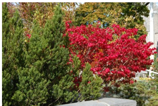
Picture taken this fall from southeast corner of church property.

SPECIAL THANKSGIVING OFFERINGS RECEIVED TO DATE ~~ $1,705 OF OUR BUDGETED FIGURE OF $4,000 ~~